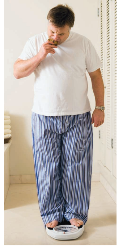
An expanding epidemic. A vaccine that could reduce weight gain would have a domino effect on other chronic conditions such as coronary heart disease, type 2 diabetes, and high blood pressure.

Pharmaceutical companies may indeed see a big market for a nicotine vaccine, but they're not sure anyone can deliver a safe, effective product. "Novartis has made some contracts with biotech companies to develop antismoking vaccines," says Rino Rappuoli, global head of vaccines research for Novartis Vaccines and Diagnostics in Siena, Italy, "but there has not been much progress. Big companies rely on biotechs to derisk the sector." As the stumbling efforts to